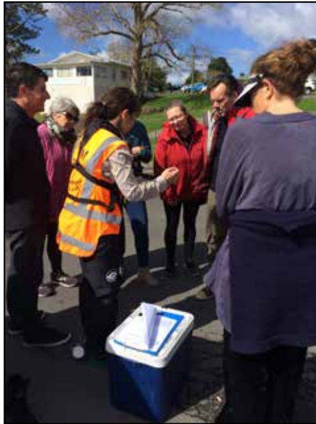
Volunteers at a Safeswim training session.

"If it goes well, we are looking to scale it up across the region," says Nick. "We are