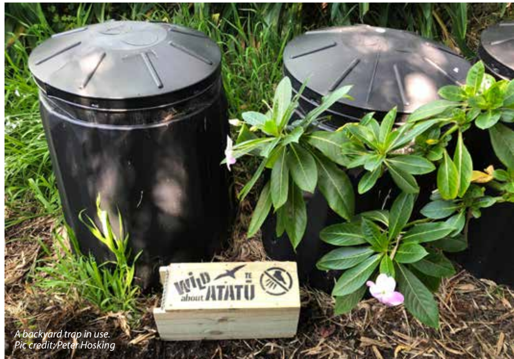
A backyard trap in use.