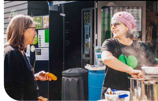
▲ EcoMatters Matariki open day.

The numbers in this report have been rounded to the nearest 10, 100 or 1,000 as appropriate.